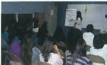
Students learning about financial literacy.

To learn more about Financial Literacy please visit: www.handsonbanking.org